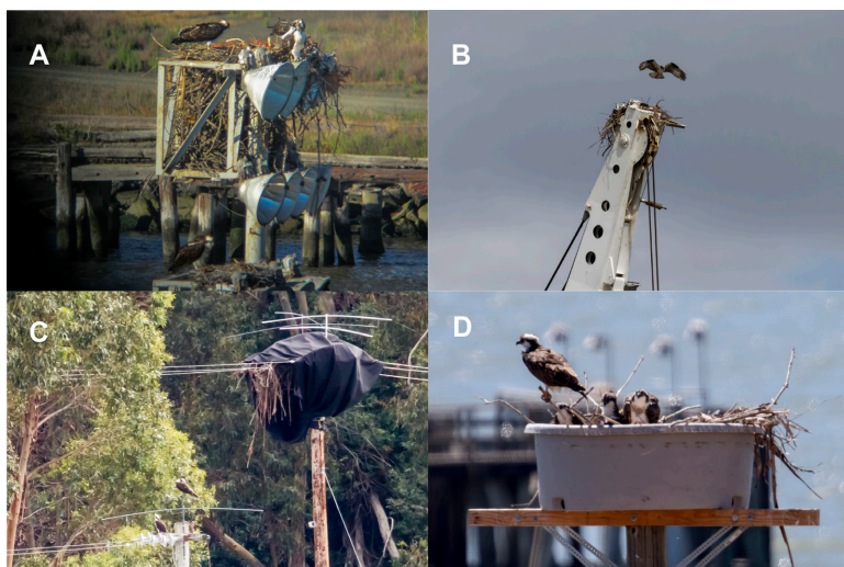
Figure 2. Osprey nests on artificial structures around San Francisco Bay. (A) Light structure on pier, Mare Island, from which three young fledged. (B) Operating crane on Mare Island where, not surprisingly, the pair failed. (C) Enshrouded nest and PVC deterrent devices installed to prevent use by Ospreys of an existing nest at Point Molate. Note the adult Osprey perched on a deterrent device. (D) Successfully used alternative nest structure installed near the nest shown in (C) with three nearly fledged nestlings.